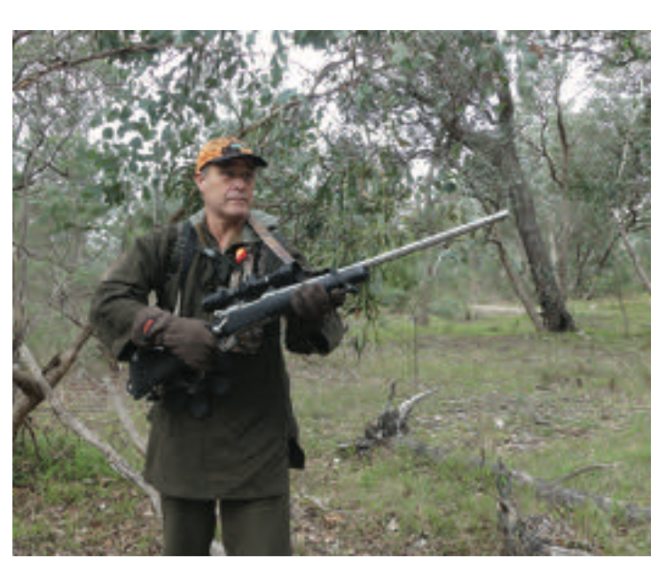
As the rifle is shouldered the butt automatically lifts out of the rear loop and then slips back into it when the rifle is lowered.