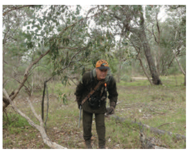
When walking under low branches or with other hunters hold the rifle at the front sling mount and bush the rifle down to the side of your body. This movement is easy and points the barrel in a safe direction.