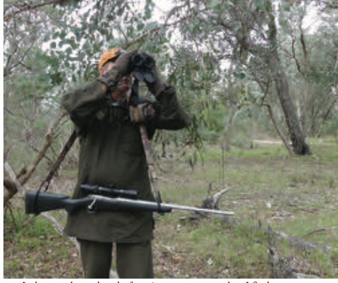
I always glass ahead of my impact zone so that I find undisturbed deer which are motionless checking me out before I enter their flight zone. The Safari Sling enables me to use both hands to eliminate bino shake so that I can spot the deer.