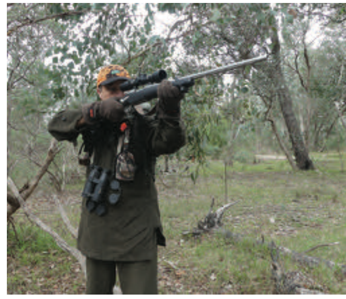
The rifle shoulders smoothly from the Safari Sling with unbelievably less movement than is required to shoulder a rifle carried in a conventional sling. Safari Slings are so superior that they make conventional slings obsolete.