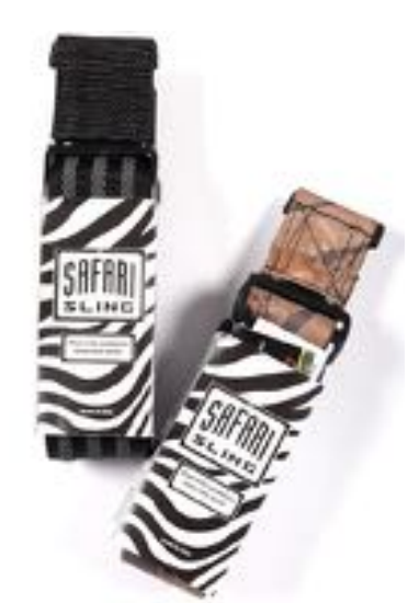
I think if you give the Safari Sling a go - like me - you will quickly fall in love with it. They are not another gimmick but definitely give you the advantage when hunting sambar and other wary game.